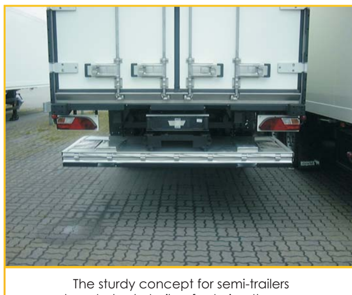
The sturdy concept for semi-trailers and central axle trailers featuring the proven Sörensen X1 Technology.

Retractable tail-lift with a capacity of 2.000 kg or 2.500 kg