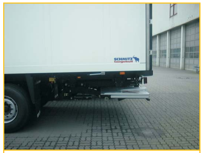
Guaranteed unproblematic loading and unloading on ramps or with forklift trucks