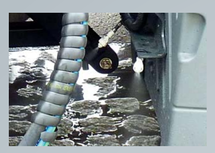
Spray jet package