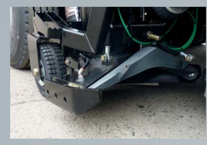
Inclined suction nozzle