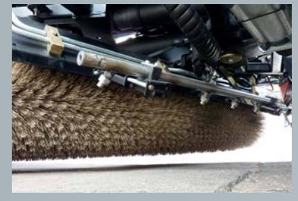
FLATJET behind the roller brush