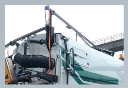
Roof arm for high-pressure lance