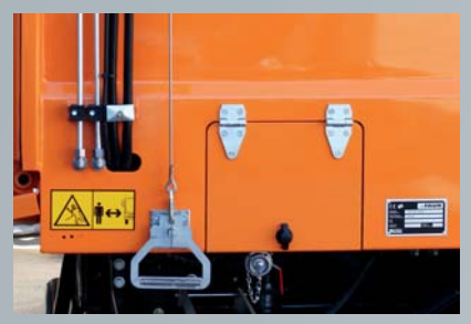
Wire rope for leaf screen