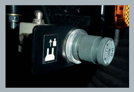
Floating suction nozzle