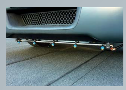
Front road-cleaning system