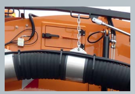
Cleaning hatch for suction channel